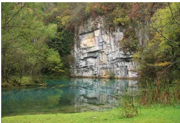
Plut D. et al., 2014. Regionalni viri Slovenije: Vodni viri Bele krajine (Water resources of Bela krajina), 15.