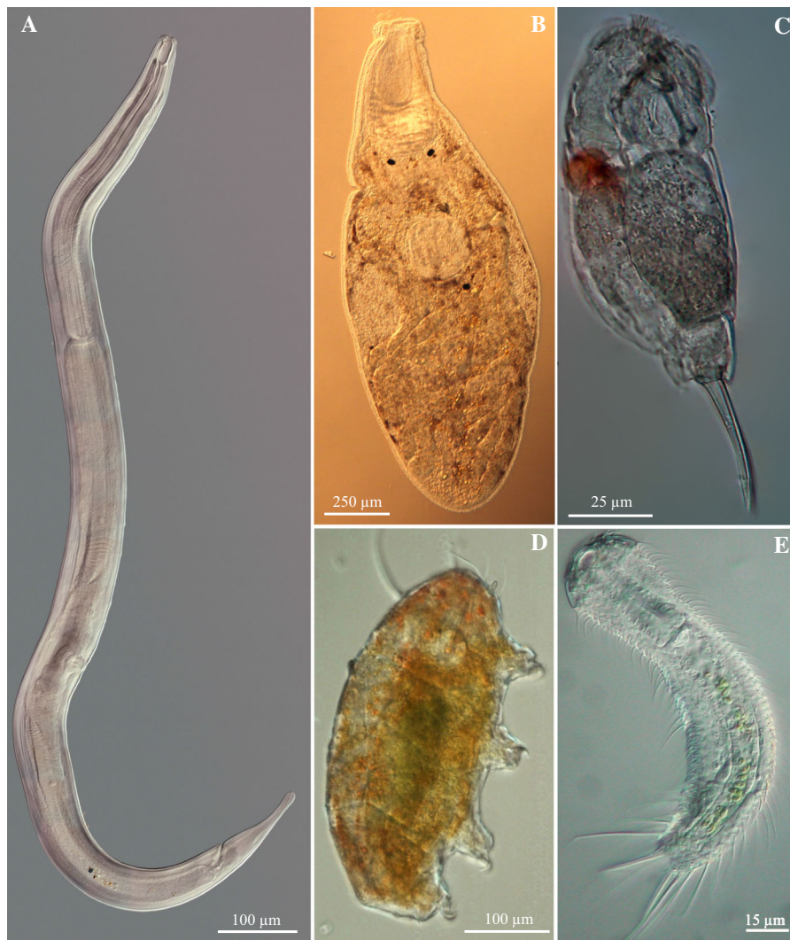
Fig. 1 Some examples of freshwater meiofauna. A Nematode. B Microturbellarian. C Rotifer. D Tardigrade. E Gastrotrich.

between 2000 and 2018. The listed results were based on searches in Google Scholar and ISI Web of Science databases. A total of 795 titles contained the terms “meiofauna” or “meiobenthos”, which we further classified as freshwater or marine studies based on the location of experimental sites, the provenance of organisms or the experimental conditions applied in case studies were performed in the laboratory. From 2000 to 2018, 174 (i.e. 21.8%) studies dealt with freshwater while 621 (72.2%) with marine meiofauna (Fig. 2), which highlights the relative paucity of freshwater meiofauna studies in comparison with marine meiofauna studies. We do not aim to speculate